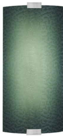
bubble glass blue

Minimal wall sconce with extruded aluminum housing and die-cast end caps. Features slumped glass, fabric, and metal shade options for optimal design flexibility. Mounts vertically only. Incandescent includes (2) E26 medium base 60 watt or equivalent BT15 halogen lamps; fluorescent includes (1) 2G11 base 24 watt twin tube compact fluorescent lamp and electronic ballast. Fluorescent version may also be lamped with (1) 2G11 base 27 watt twin tube compact fluorescent lamp (not included). ADA compliant. 120 or 277v.