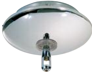
Shown approx. 25% actual size.