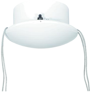
Shown approx. 15% actual size.