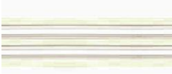
Shown actual size: (0.90" height x 0.30" width)