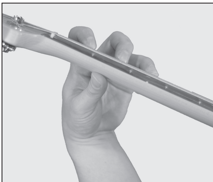
Position your fingers as if gently squeezing a ball between them and your thumb.