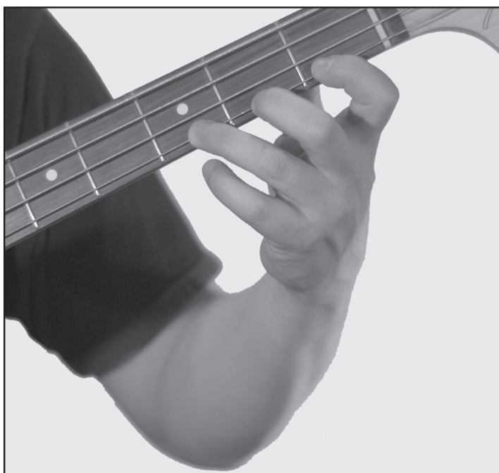
Keep your elbow in and fingers curved.

Learning to use your left-hand fingers starts with a good hand position. Place your hand so your thumb rests comfortably in the middle of the back of the neck. Position your fingers on the front of the neck as if you are gently squeezing a ball between them and your thumb. Keep your elbow in and your fingers curved.